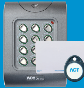
ACT 5e prox Digital Keypad & Proximity