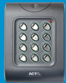
ACT 5e Digital Keypad