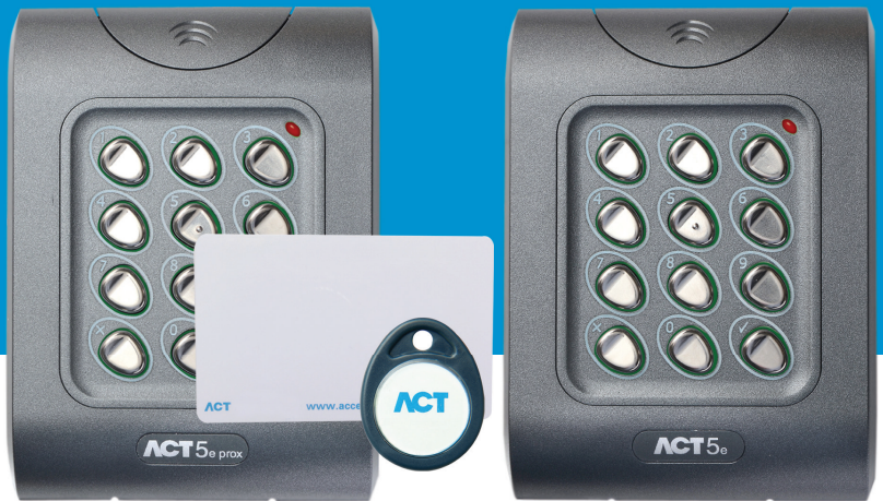
ACT 5e prox Digital Keypad & Proximity